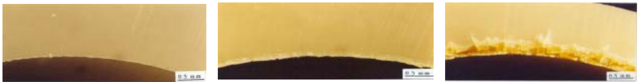
2.A: 10% of Pipe Lifetime