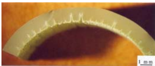
Figure 3: Radial Crack Growth in a PEX Pipe Material.